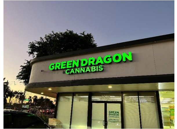
West Palm Beach