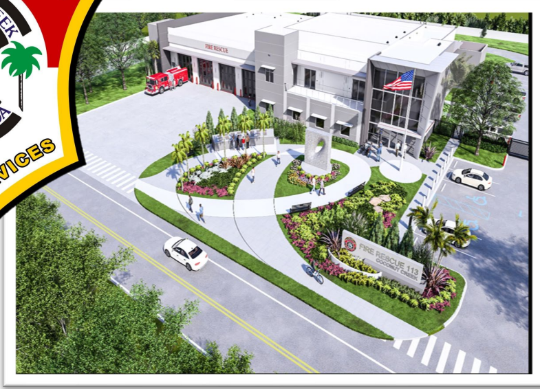
FIRE STATION 113 AND FIRE ADMINISTRATION