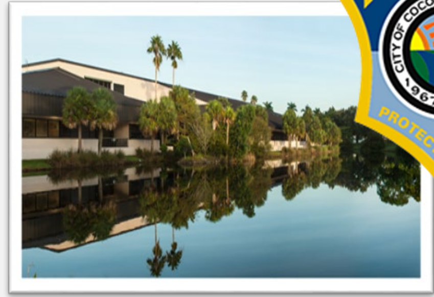
POLICE STATION IMPROVEMENTS