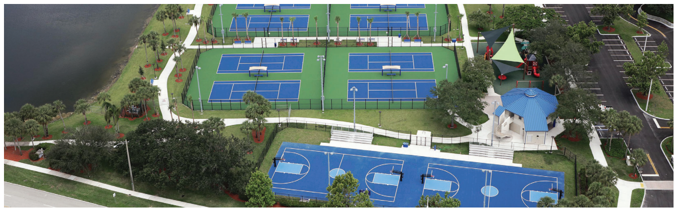
Newly Renovated Windmill Park