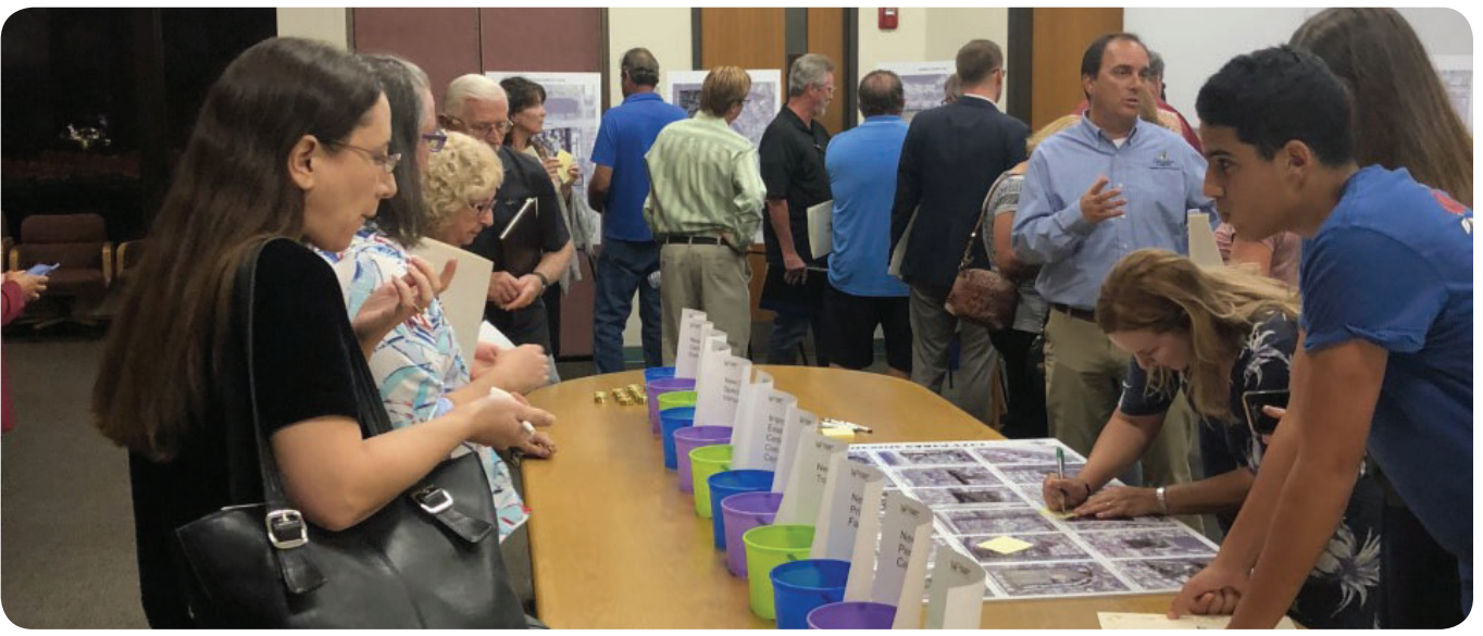
Public Workshop Prioritization Exercise

The City's parks planning consultant Barth Associates used a "mixed-methods, triangulated" process to determine resident's parks and recreation needs and priorities. Qualitative needs assessment techniques included site evaluations, stakeholder interviews, focus group meetings and public workshops. Quantitative techniques included a level-of-service analysis, statistically-representative mail survey, and an on-line survey.