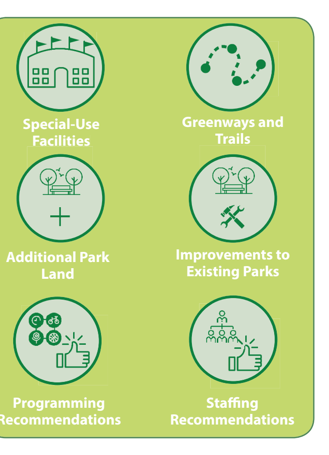
Long Range Parks and Recreation System Vision

Estimated "order-of-magnitude" costs to implement the proposed long-range vision are approximately $134 million in capital improvements, plus an estimated $3.3M per year in additional operations and maintenance costs once the improvements are constructed. More detailed site analyses, site plans, design, and engineering studies will be required to estimate costs more accurately.