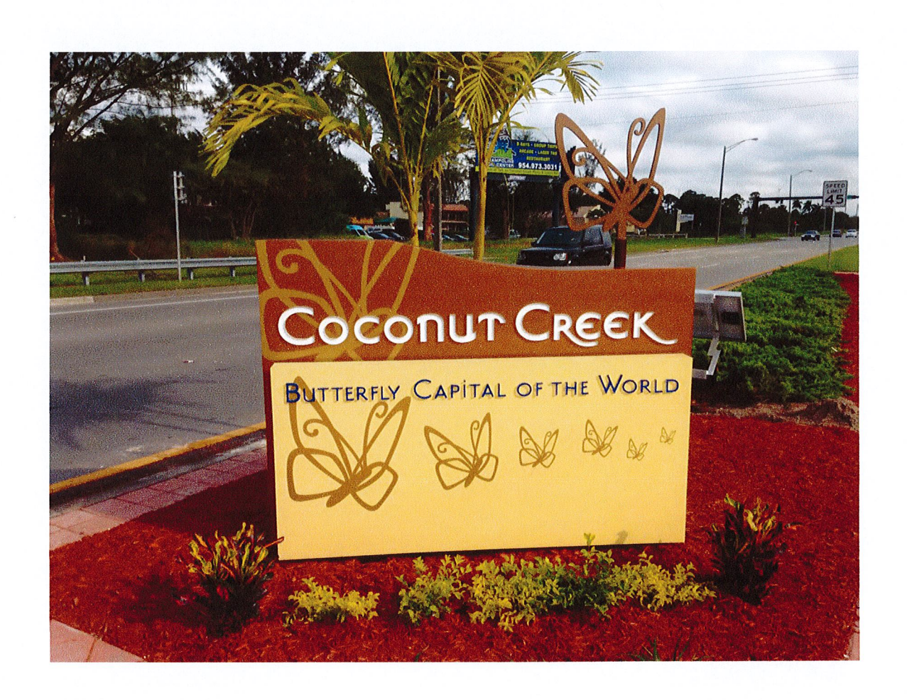
EXHIBIT A CITY OF COCONUT CREEK MUNICIPAL ENTRY SIGN