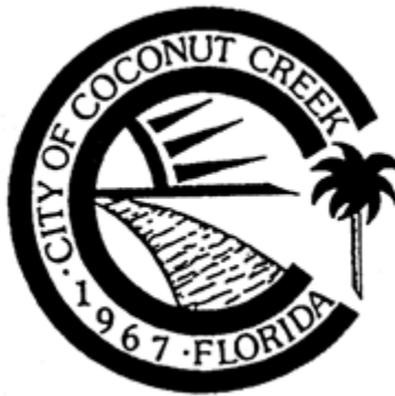
Official logo for the city