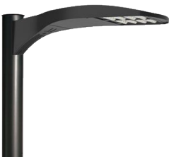
(Top) Luminaire, Pole (Right), & Pole with Luminaire (Left)