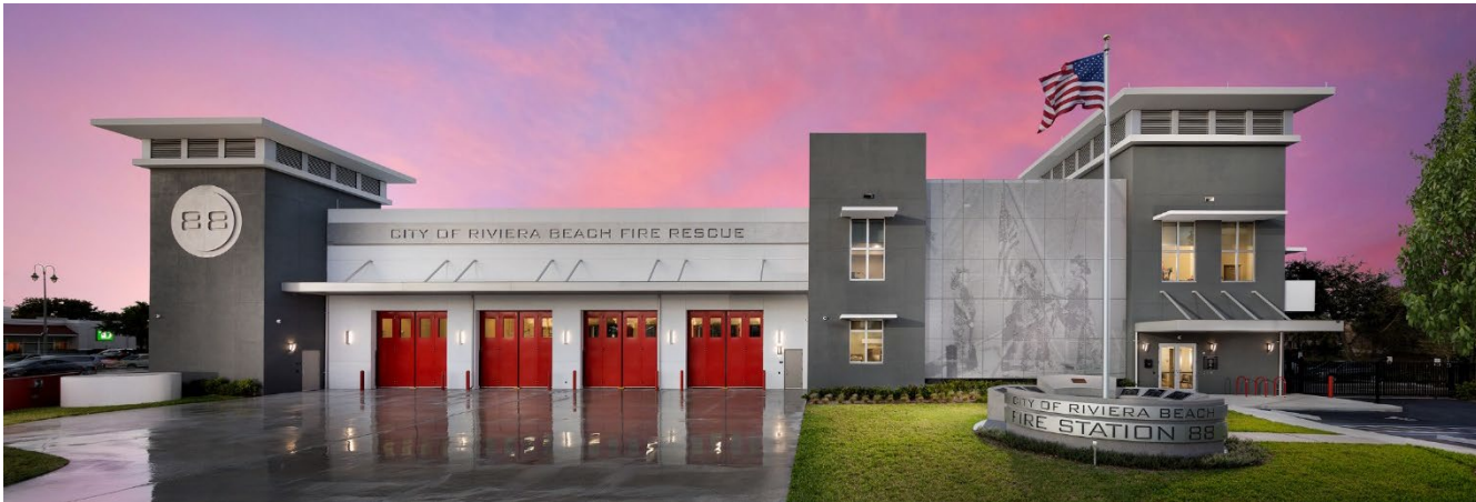
RIVIERA BEACH FIRE STATION 88