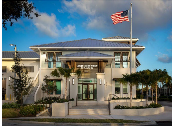
LIGHTHOUSE POINT STATION 22 and EOC