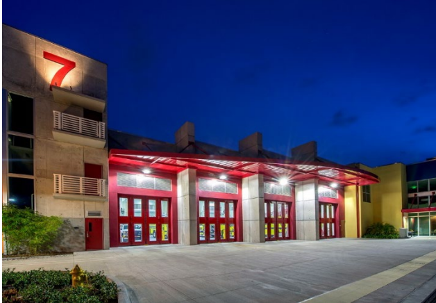
HALLANDALE FIRE STATION NO. 7