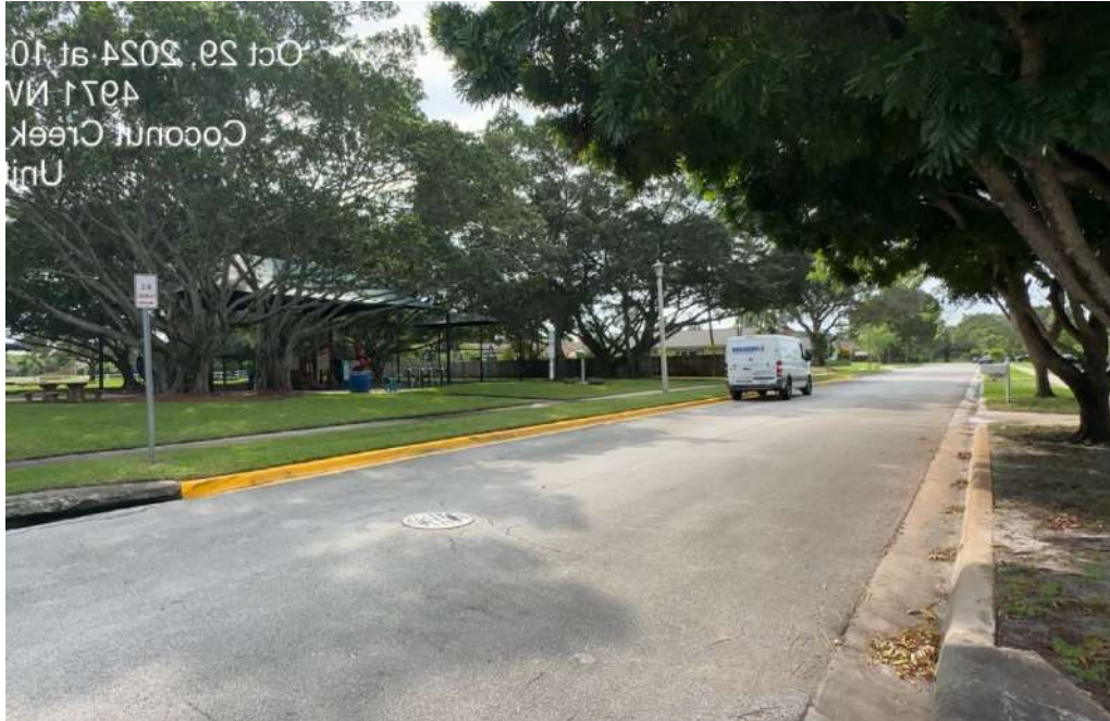
Lakewood Park and “No Parking” Signage