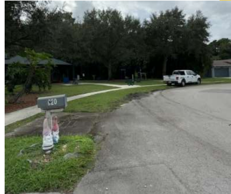
Lack of Parking and Damaged Swales