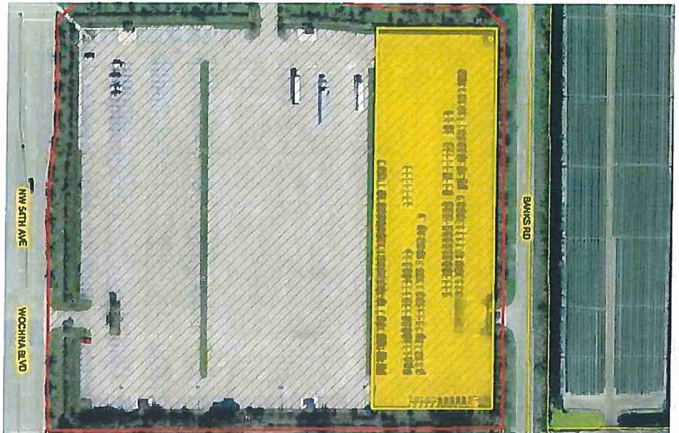
EXHIBIT "C" Lease Area

That portion of Tract "E" Commerce Center of Coconut Creek, according to the Plat thereof, as recorded in Plat Book 131, Page 30, of the Public Records of Broward County, Florida, highlighted on the sketch depicted above, comprising approximately three acres.