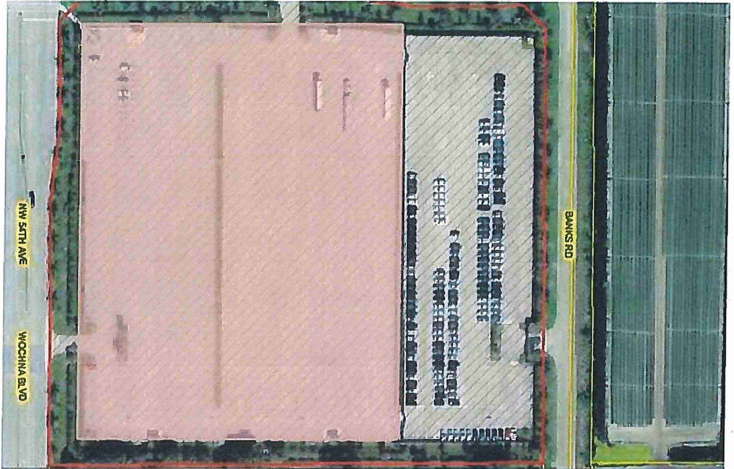
EXHIBIT "B" Property (Seminole Use Area)

All of Tract E, Commerce Center of Coconut Creek, according to the Plat thereof, as recorded in Plat Book 131, Page 30, of the Public Records of Broward County, Florida, as highlighted in the sketch above, not including the approximately three acre fenced in area depicted above.