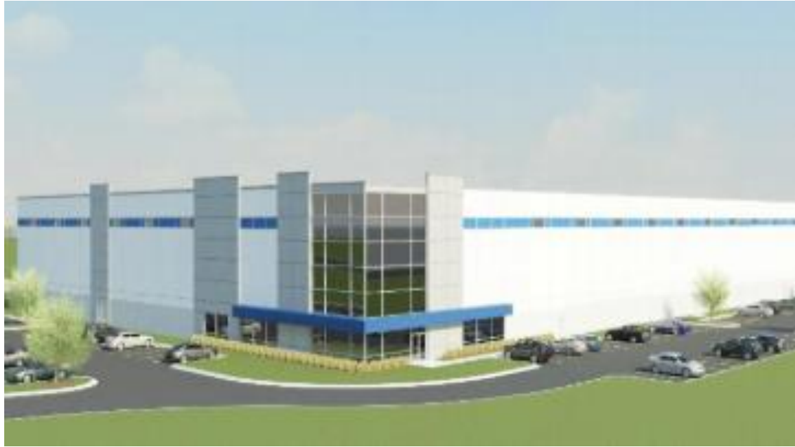
First Joliet Logistic Center