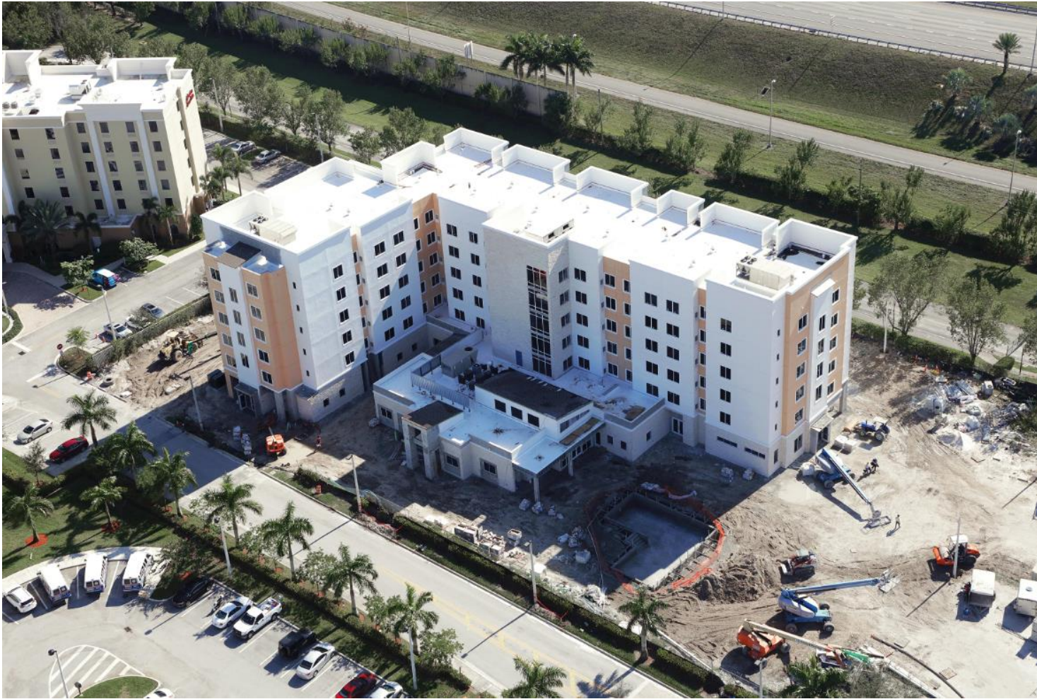
Residence Inn by Marriott