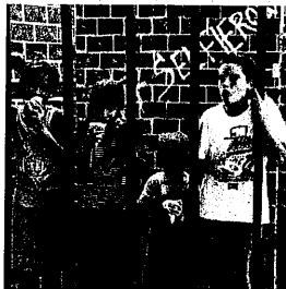
Jail 'n Bale Inmate Fundraiser

Tomorrow's Rainbow Mini-Ranch 4341 NW 39th Ave | Coconut Creek 33073 TomorrowsRainbow.org 954.978.2390