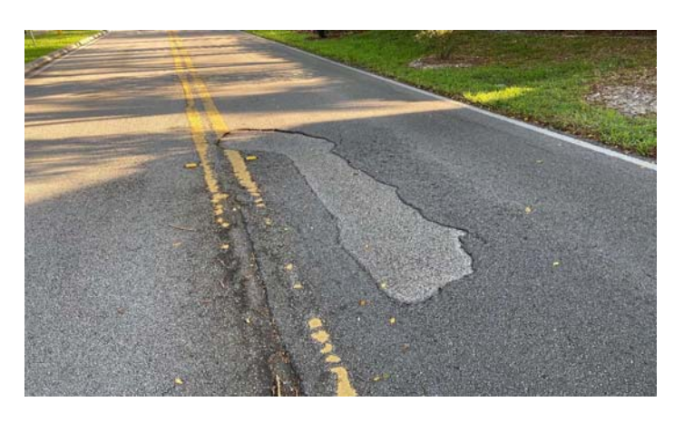
NW 42<sup>nd</sup> Ave – Raveling