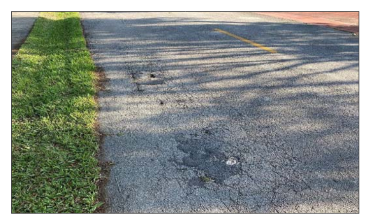
SW 40<sup>th</sup> Ave – Raveling