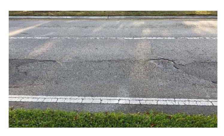
NW 42nd Ave - Raveling, Alligator Cracking and Patching