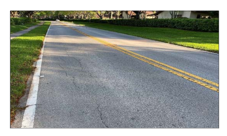
Carambola Cir N – Linear Cracking