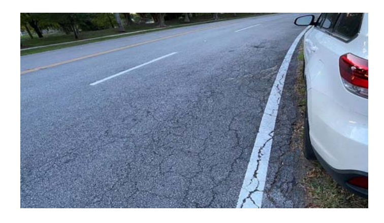
Hammocks Blvd – Alligator Cracking and Edge Cracking