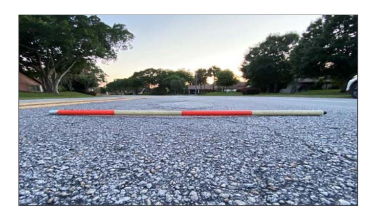
Hammocks Blvd - Rutting