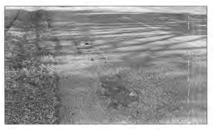
SW 40<sup>th</sup> Ave - Raveling