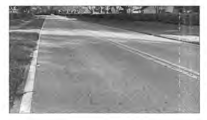
Carambola Cir N – Linear Cracking