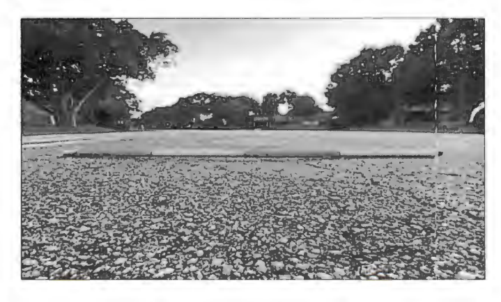
Hammocks Blvd - Rutting