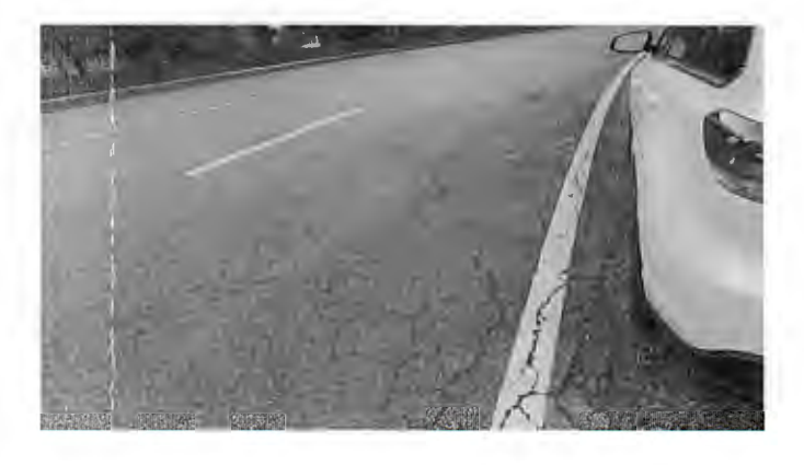
Hammocks Blvd - Alligator Cracking and Edge Cracking